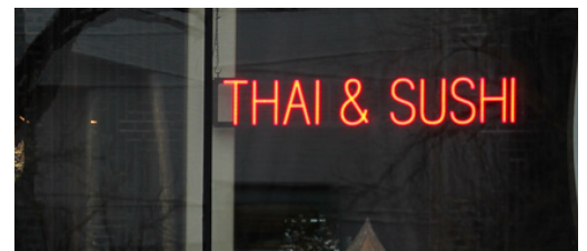
The SpellBrite system allows business owners to create customized messages that help attract more customers to their location. (The photos on this page are of SpellBrite Red letters. The intense brightness of the letters can make them look white/red in photos.)