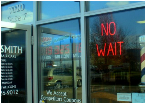
When there is no wait, this barber turns on his SpellBrite sign to attract customers.