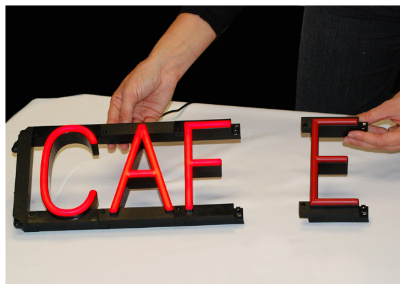
SpellBrite LED Signage is comprised of interlocking letters that allow users to easily assemble a powerful, customized illuminated sign in minutes.

With SpellBrite, you get the same bright pop of neon signs, but none of the hassles.